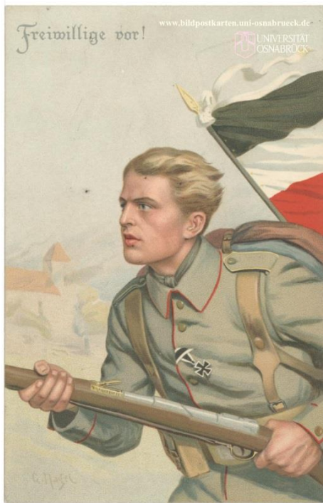
Image Q1: Soldier on an army postal service letter. Caption: "Volunteers first!" Dated to May 1915.