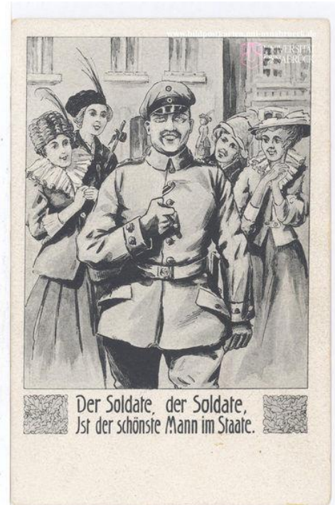
Image Q2: The effect of a soldier to the female community members. Caption: "The soldier, the soldier is the best man in the nation." Dated to November 1917.